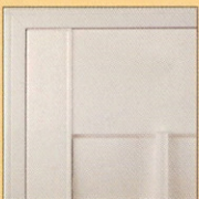
Designer Z Frame with Flex